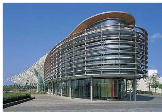
FinanzIT headquarters in Hanover, Germany (source: FinanzIT)

With the help of Babylon-Corporate, FinanzIT was able to create a glossary of terms unique to DSGV by importing information from existing sources and searching for systematic usage of recurring terms.